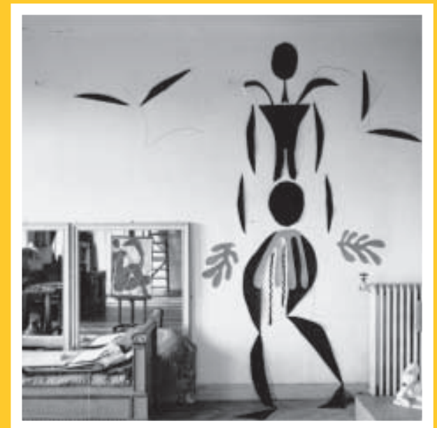
The artist's studio in Nice

Can you guess which pictures he painted first? On the last pages in this book you will find them all listed with the year in which they were produced.